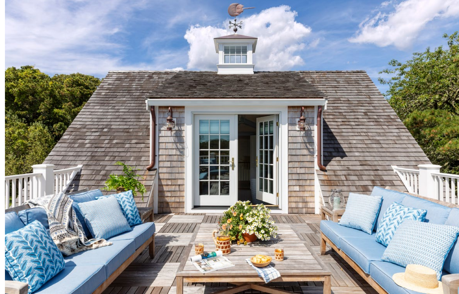
The new roof deck maximizes the property's stunning views over the Mill Pond and beyond.

Equipped with a wet bar, a sitting area, a half bath, and large French doors that open onto a bluestone terrace, the cabana “has a life of its own,” notes Ahearn. Above it, a generous deck provides the perfect perch for morning coffee or evening cocktails overlooking the pool, with views of the Mill Pond and beyond. “The cabana ensemble is really nice,” says the architect, “and it was missing before.”