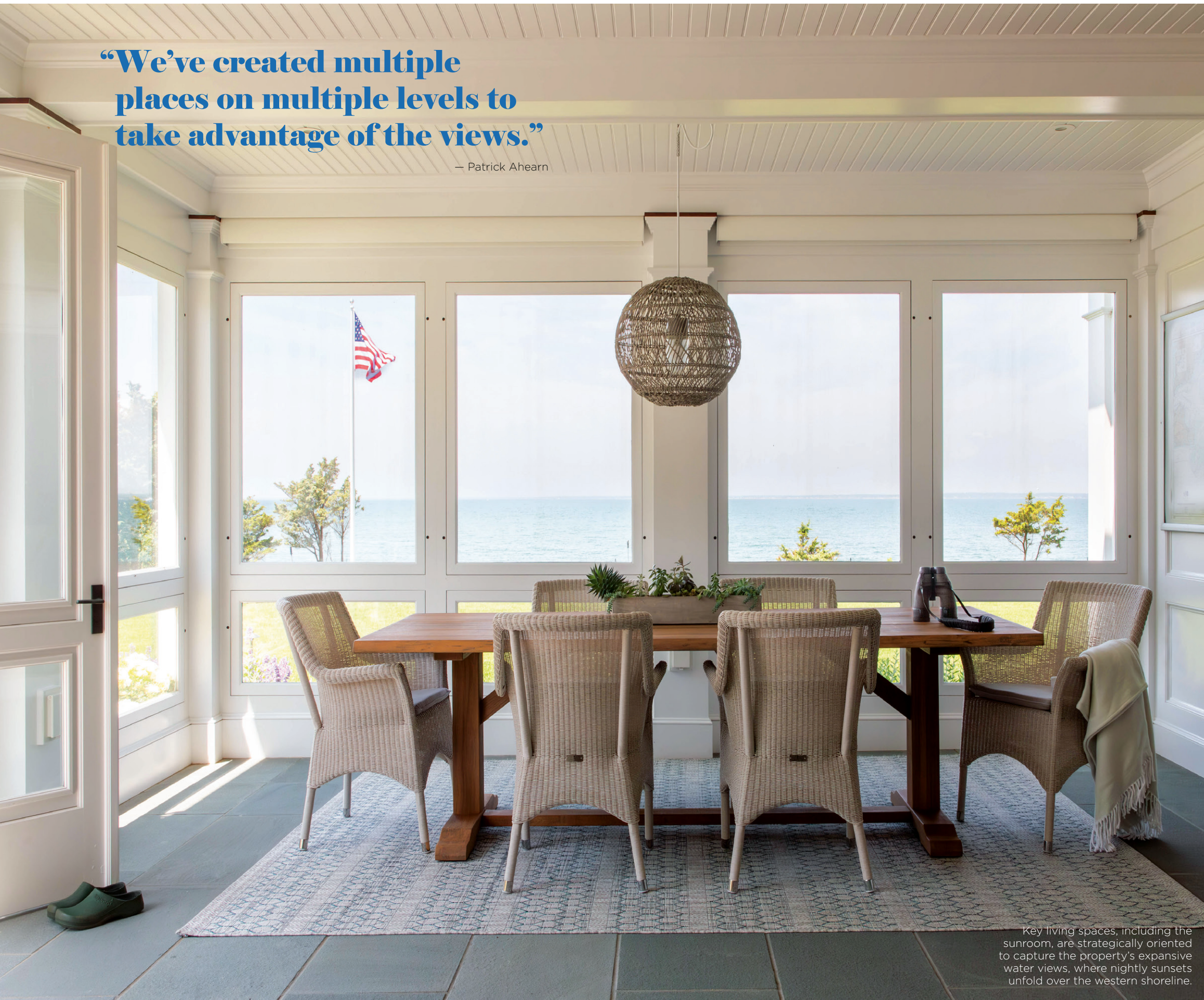
Key living spaces, including the sunroom, are strategically oriented to capture the property's expansive water views, where nightly sunsets unfold over the western shoreline.