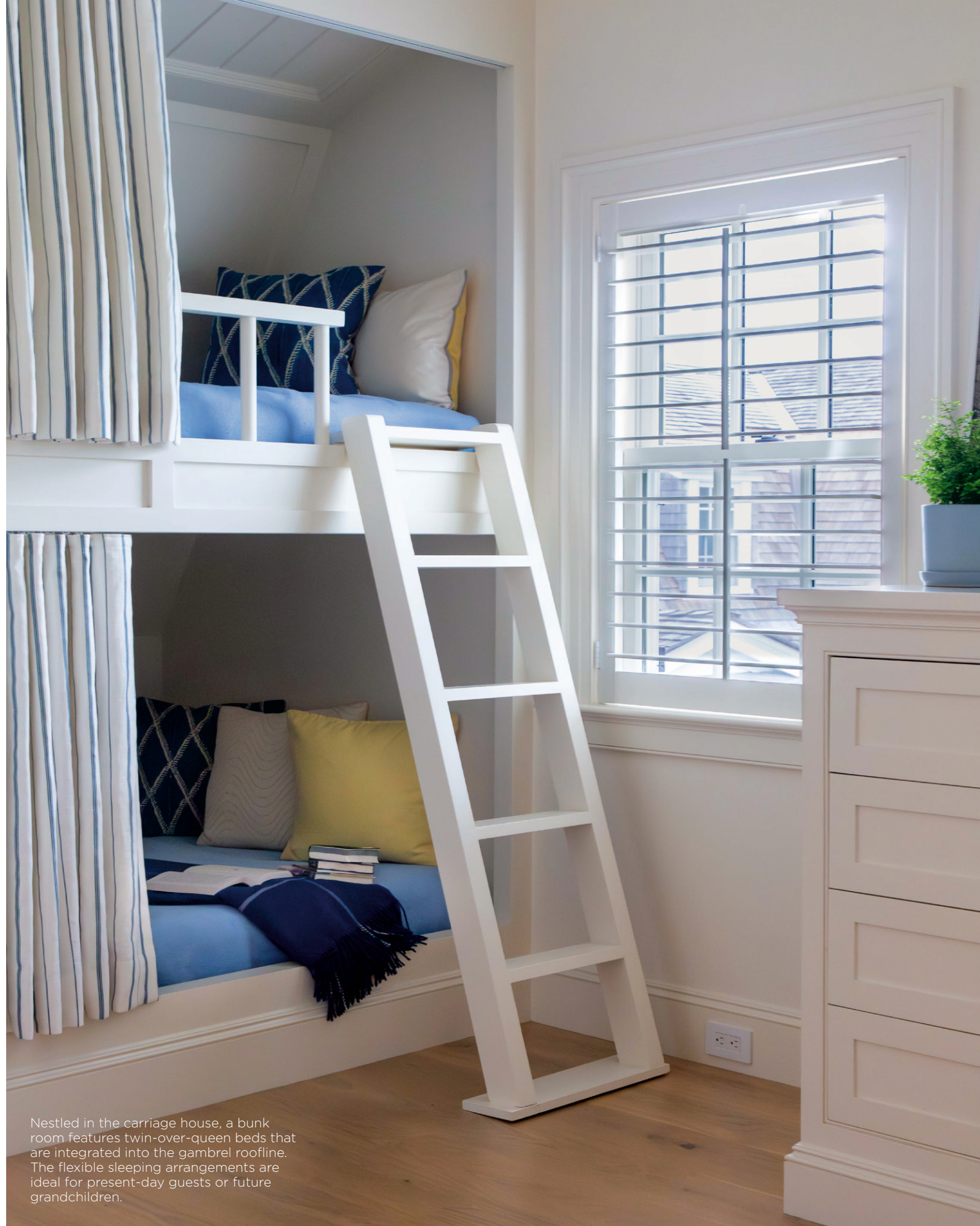
Nestled in the carriage house, a bunk room features twin-over-queen beds that are integrated into the gambrel roofline. The flexible sleeping arrangements are ideal for present-day guests or future grandchildren.