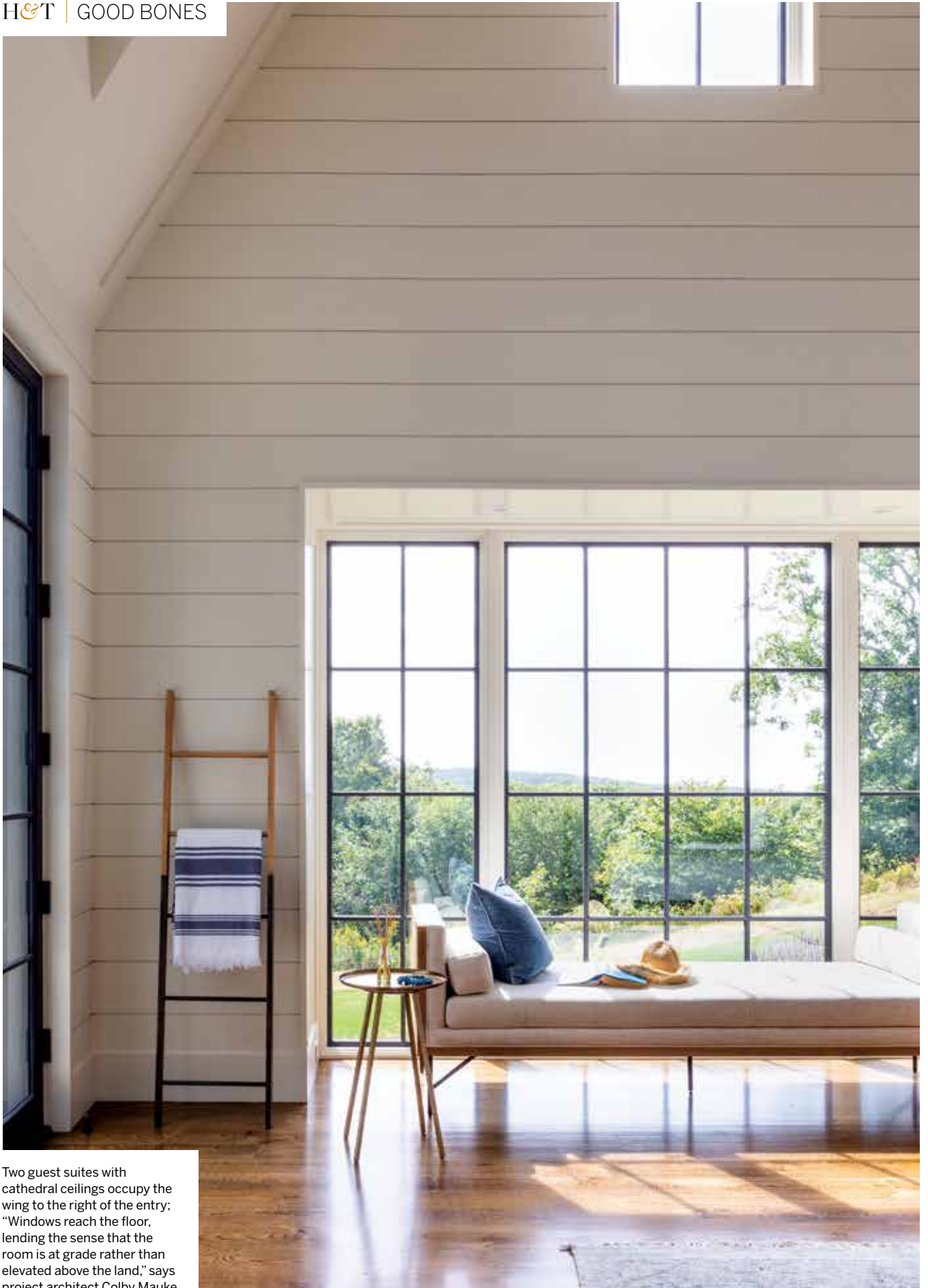
Two guest suites with cathedral ceilings occupy the wing to the right of the entry: "Windows reach the floor, lending the sense that the room is at grade rather than elevated above the land," says project architect Colby Mauke.