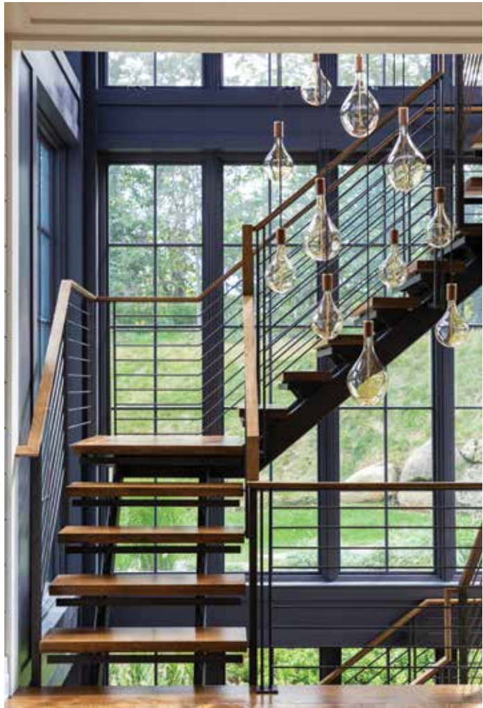
ABOVE: Operable windows in the stair bays let cool air come in around the gardens and hot air dissipate out the top. LEFT: Large bifold doors unite the family room and covered porch, creating an immersive indoor-outdoor experience.