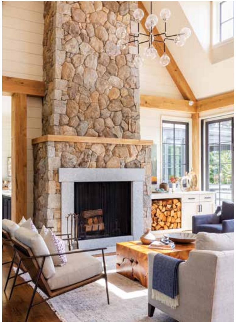
RIGHT: In the great room, a New England fieldstone fireplace with a granite surround echoes the stacked stone walls on the property. Douglas fir posts and beams add warmth, as does horizontal nickel board. BELOW: An interior glass wall separates the wife's office from the seating area in the great room. The light-filled workspace has a view of the property's party barn across the meadow and features a hanging bench slotted into a square bay.