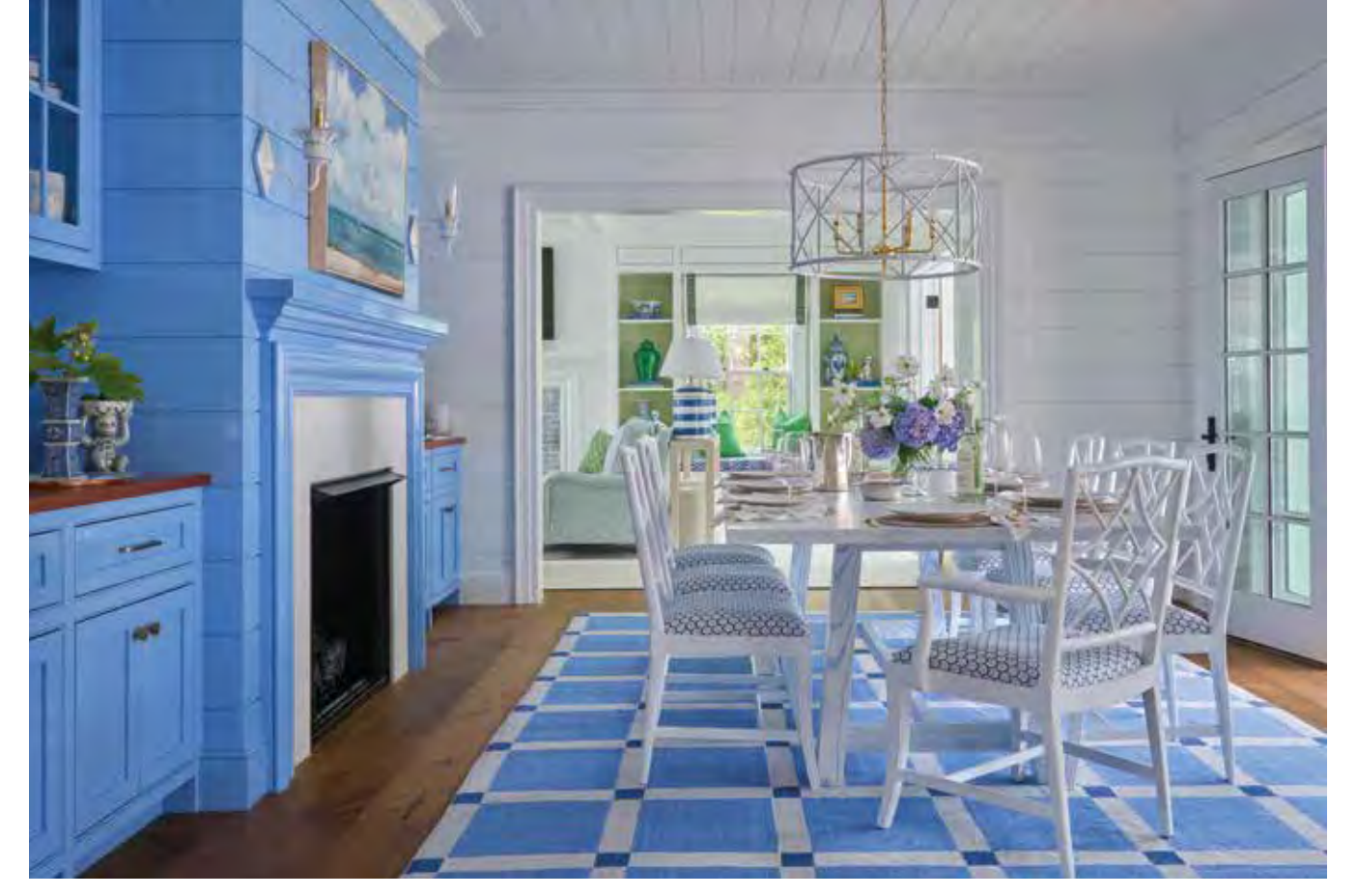
CLOCKWISE FROM ABOVE: The fireplace wall in the dining room is painted a custom shade from Fine Paints of Europe; "That hydrangea blue is a color they love, and it feels so them," says Mattison. A bar area painted the same hue flanks the fireplace. The shade pops up again in the powder room, which is sheathed in a Thibaut wallpaper.