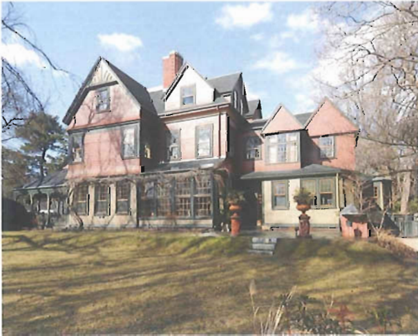
Residential: Restoration, Renovation or Addition over 5,000 SF Cambridge Residence Judge, Skelton & Smith, Architects