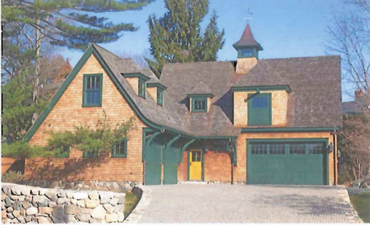
Residential: Restoration, Renovation or Addition under 5,000 SF Shingle Style Carriage House Frank Shirley Architects