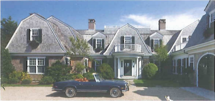
Residential: New Construction over 5,000 SF Plantingfield Way Patrick Ahearn Architect