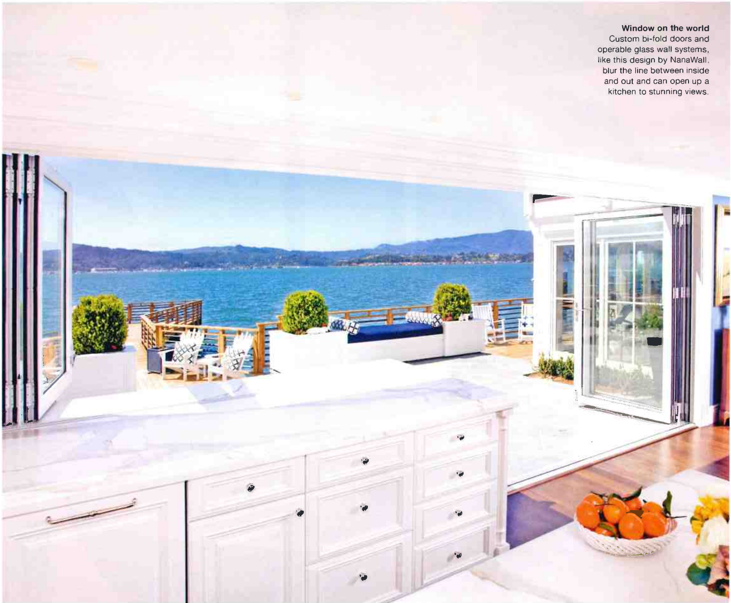
Window on the world Custom bi-fold doors and operable glass wall systems, like this design by NanaWall, blur the line between inside and out and can open up a kitchen to stunning views.