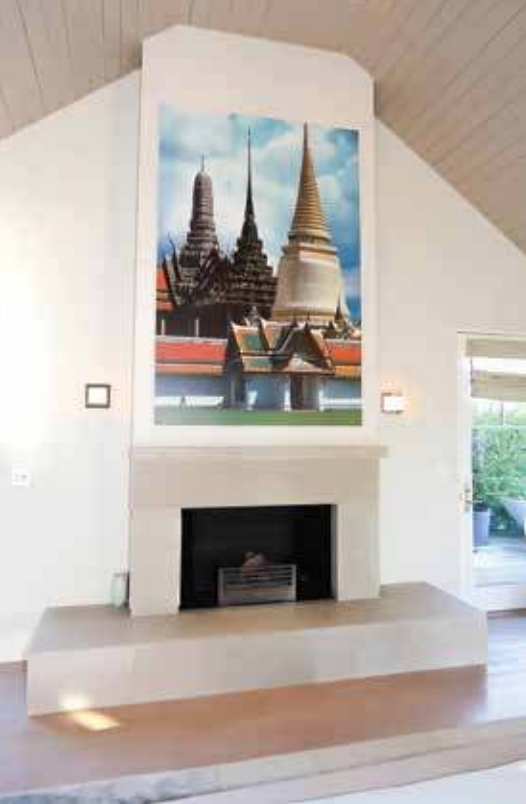
The house is a gallery for various art mediums. Homeowner Elrick Williams captured this photo of the Temple of the Emerald Buddha in Thailand.