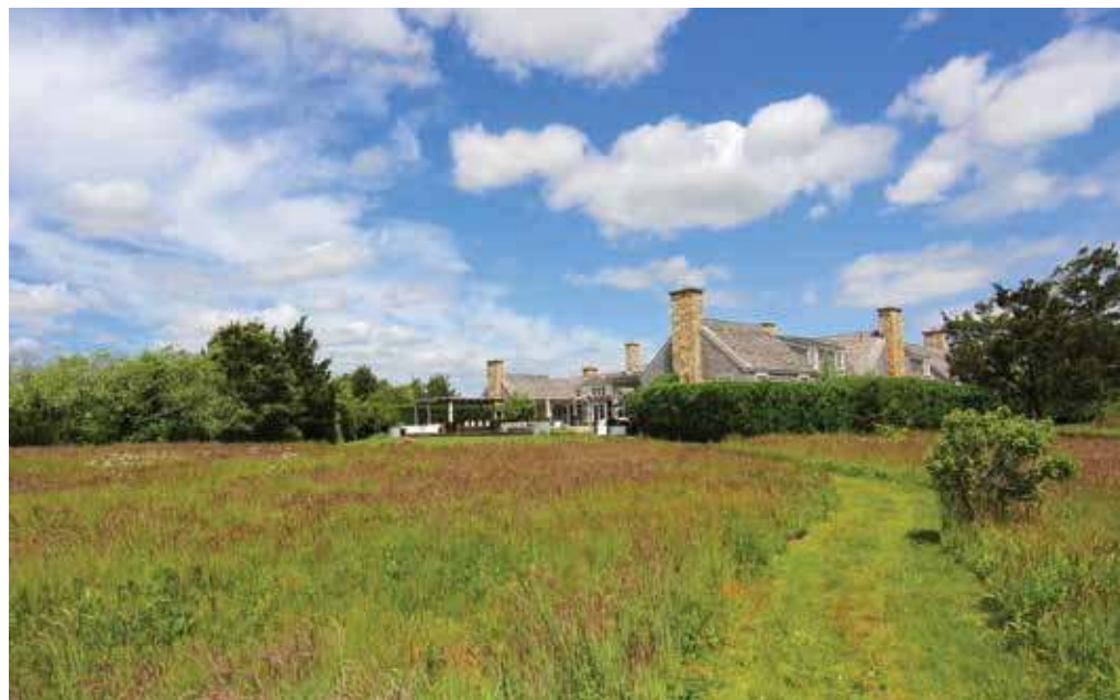
Located near South Beach on Martha's Vineyard, Trelawny House is an island oasis and a great family gathering spot for the homeowners.