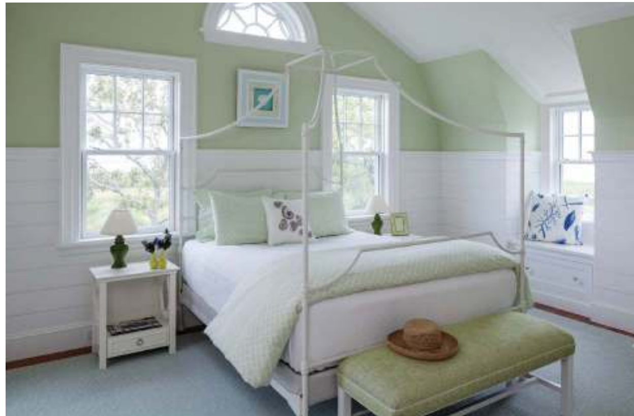
Clockwise from above left: The cozy library/den; open spaces in soft hues like cream and beige flow together; the pool is situated to provide privacy; light and airy is the theme in this pretty green and white bedroom.

The interior of the house is awash in summer shades of cream, beige, pale greens and soft blues, with bead board walls and coffered ceilings capturing the essence of life on the Vineyard. "The homeowners wanted it to be light and airy, to have all the spaces flow together so that it would reflect a casual New England lifestyle," Ahearn says.