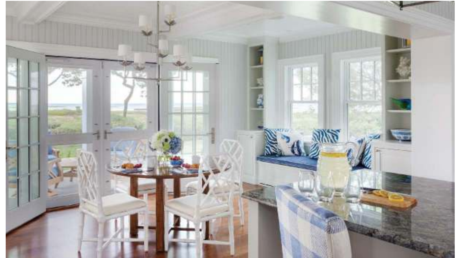
Left and above: From the kitchen, family room, screened-in porch and outside patio, the view is spectacular.