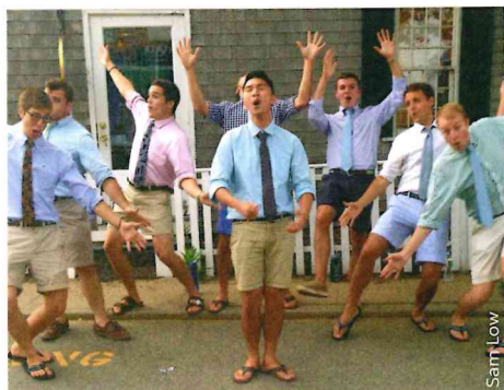
Vineyard Sound sings a cappella.

Looking for boat shoes, brick-red shorts, summer shifts and button-down shirts in bright colors and patterns? Edgartown retailers will help you get your prep on. Start on North Water Street with Vineyard Vines, but don't miss Sundog, Summer Shades, and Katydid on Main Street, and Island Company North on South Water Street. For the rebel in the group, the Boneyard on Main Street offers surf-skate styles.