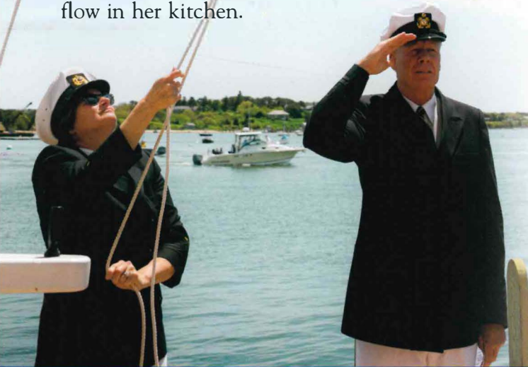
The first steps...

Commissioning 2019 was such a beautiful day that no one seemed to remember when life was as good. Our new clubhouse was in Bristol condition (a word yachtsmen, including all EYC members, use to refer to something that is stunningly beautiful!), the staff was eager to show off the new facility and Chef Carolyn prepared an over-the-top assortment of hors d’ouerves that took every advantage of more space and streamlined production flow in her kitchen.