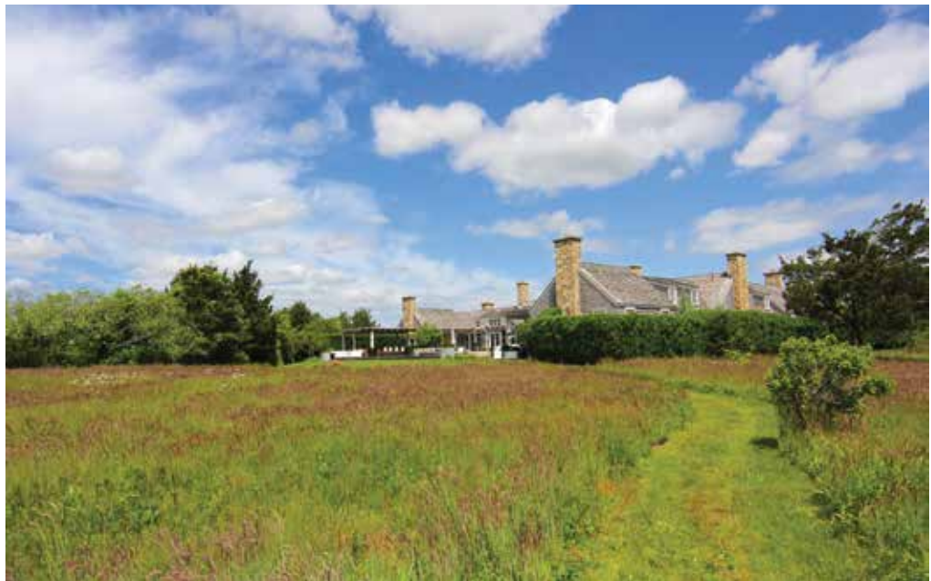
Located near South Beach on Martha's Vineyard, Trelawny House is an island oasis and a great family gathering spot for the homeowners.