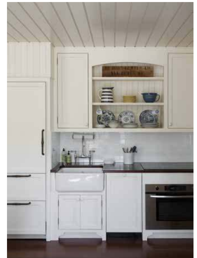
Above and right: A two-bedroom family suite in the carriage house, complete with a breakfast area and kitchenette, allows guests to feel right at home.