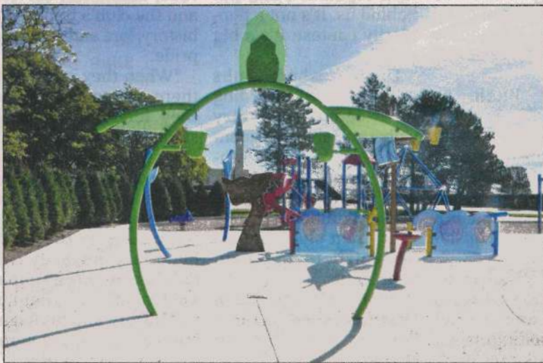
The outdoor family recreation area is a fairly recent addition to the Grosse Pointe Yacht Club.