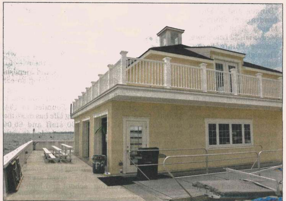
The Marine Activity Center was added to the club in August 2017.