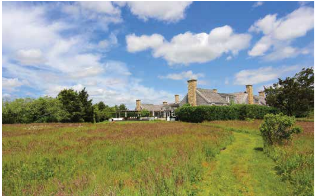
Located near South Beach on Martha's Vineyard, Trelawny House is an island oasis and a great family gathering spot for the homeowners.