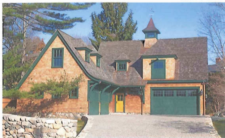
Residential: Restoration, Renovation or Addition under 5,000 SF Shingle Style Carriage House Frank Shirley Architects