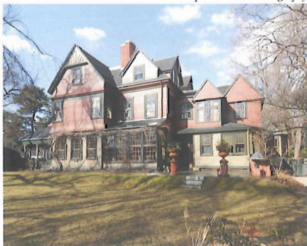
Residential: Restoration, Renovation or Addition over 5,000 SF Cambridge Residence Judge, Skelton & Smith, Architects